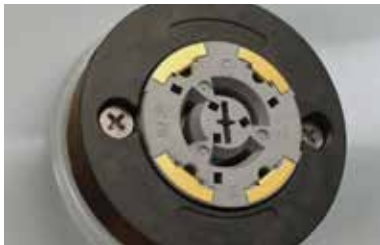
NEMA 7-pin rotatable photocontrol receptacle