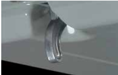
Thumb-latch for tool-less entry