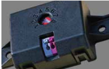
Field-adjustable output module