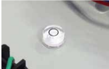
Internal bubble level facilitates installation