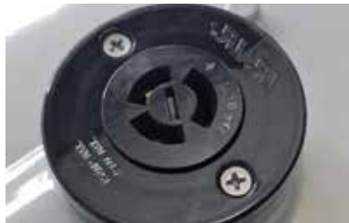
NEMA 3-pin rotatable receptacle