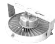
Surface Mount Bracket