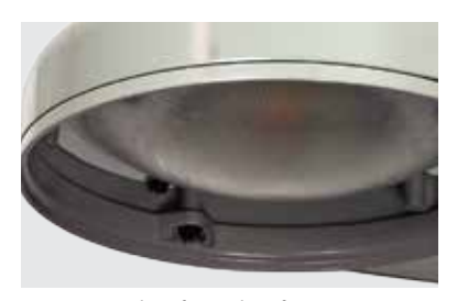
Prismatic acrylic refractor lens for enhanced visual comfort