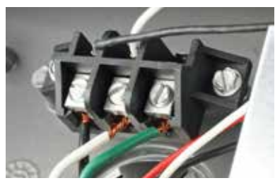
Terminal block can be wired using only a flat blade screwdriver