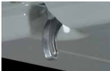
Thumb-latch for tool-less entry