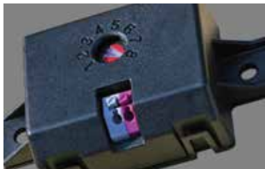
Field-adjustable output module