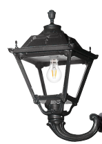
Tobia / Ofir