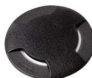
Ceci 160 3L