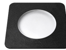
Ceci 160 SQ