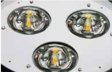
High efficacy LED engines with durable prismatic glass optics