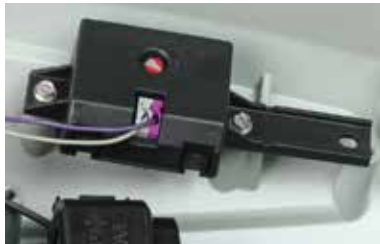
Field-adjustable output (FAO) module