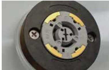
NEMA 7-pin rotatable photocontrol receptacle