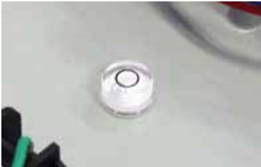
Internal bubble level facilitates installation