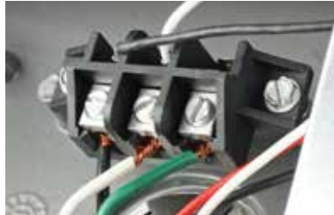
Terminal block can be wired using only a flat blade screwdriver