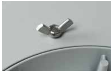
Stainless steel thumb-screw for tool-less access