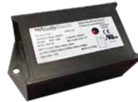
20kV/10kA "extreme" surge protection device with functional indicator light