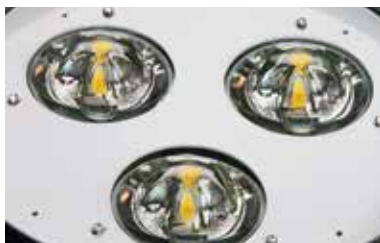
High efficacy LED engines with durable prismatic glass optics