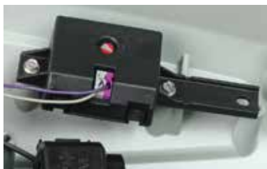
Field-adjustable output (FAO) module