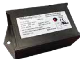
20kV/10kA "extreme" surge protection device with functional indicator light