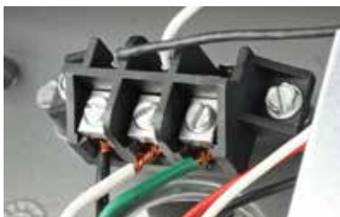
Terminal block can be wired using only a flat blade screwdriver