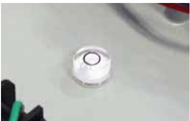
Internal bubble level facilitates installation