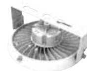
Surface Mount Bracket